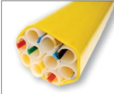
Nexpoly tubing bundle