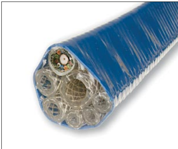
Nexbraid® hose bundle with control wires