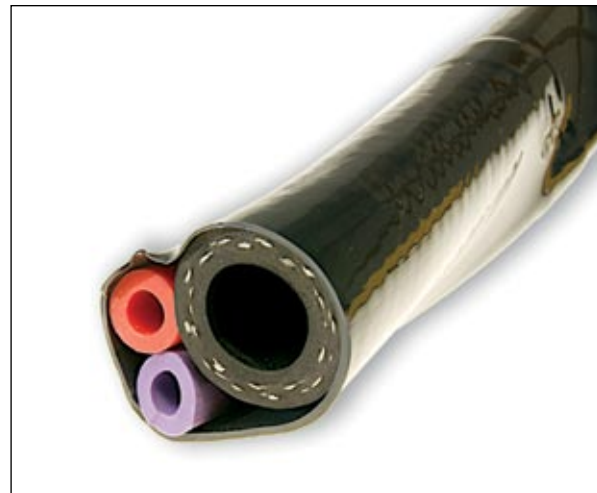
Nexsyn tubing, rubber hose bundle