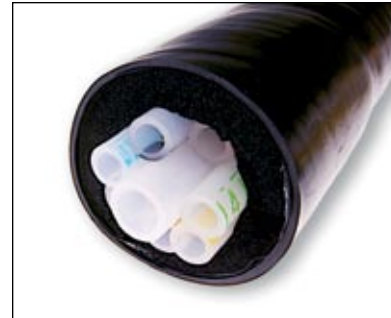
Insulated Nexflo tubing bundle