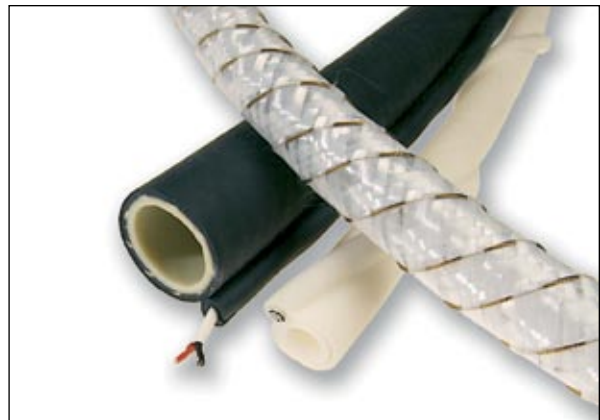
Hose and tubing with communication wires