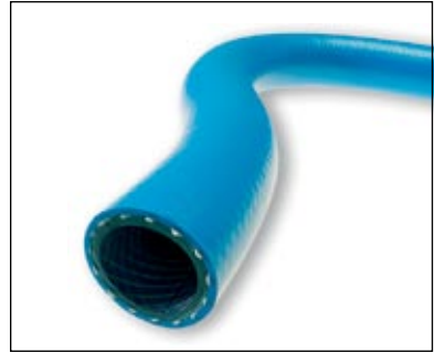
Custom formed hose