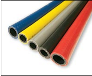
Welded hose ribbons