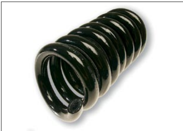
Custom formed hose